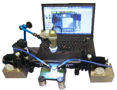
Horizontal probing of RF Module This simple, easy-to-use probe station with probes are ideal for testing antennas, RF modules and PCBs.