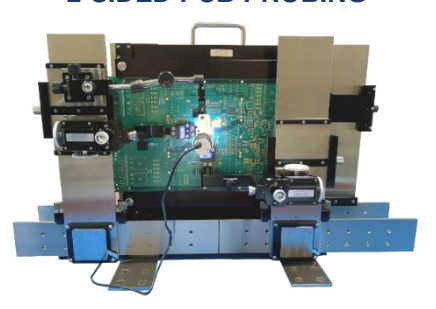
2-Sided Probe Station (VPS10) VPS10 probe station makes 2-sided probing easy and is designed for laboratories with limited space.