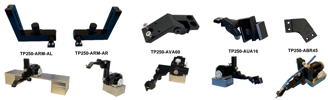
TP250 Probe arm can be adjusted for different orientations and positions without using any tool.